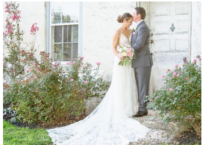
Below Left: Aaron Hamrick Photography. Below Right: Silver Pixels Photography