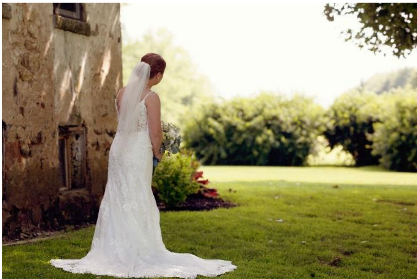
1000 Words Photography

Imagine centuries old trees, glistening water views, lush green lawns, historic 1740 manor house, custom slate and stone staircase on the hill, white arched arbor by the lake, native grasses, weeping willows, cattails, meadows, bridges, blue herons, flowers, formal landscapes, wildlife & more.