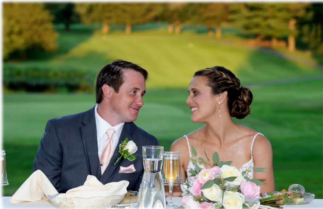
Silver Pixels Photography. View From Party Pavilion.

Tab Bar Drink Prices include Maryland State Tax.