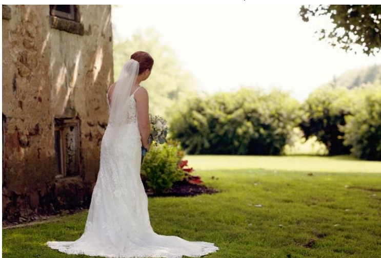
1000 Words Photography

Imagine centuries old trees, glistening water views, lush green lawns, historic 1800s manor house, custom slate and stone staircase on the hill, white arched arbor by the lake, native grasses, weeping willows, cattails, meadows, bridges, blue herons, flowers, formal landscapes, wildlife & more.